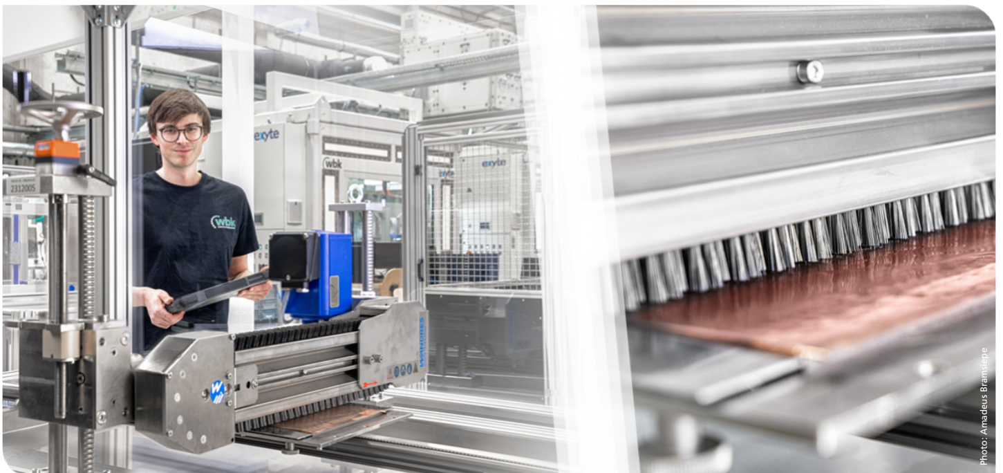
Experimental setup for the direct recycling of battery electrodes through utilization of a sword brush.

The technological concept, namely a process chain for the direct recycling of active materials (LFP and graphite), was developed as part of the DiRecFM research project (FKZ: WM34-42-57/28). This project aims to fundamentally improve the battery ecosystem. Coated and dried electrode foils form the starting point of the process chain and are delaminated in a first step. The active material is then prepared for return to production by dispersing and centrifuging.